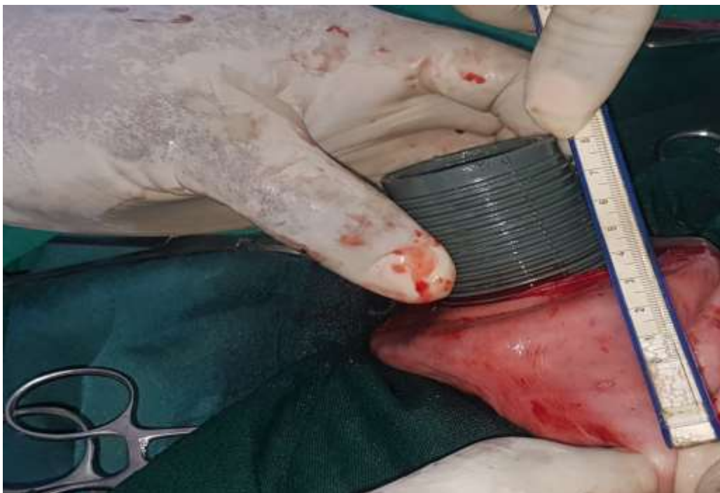
Figure 1: An improvised polyvinyl chloride plastisol as rumen cannula inserted via a primary rumen incision and measuring a 4cm distance to a point for a 3cm secondary rumen incision.

GraphPad Prism version 9.0 for Windows, GraphPad Software, San Diego, California USA, www.graphpad.com , was used to calculate the M±SE rectal temperature, respiration, and heart rates for all the groups of rams. Two-way repeated measures ANOVA with Bonferroni post-hoc test was employed to compare the three groups A, B, and C throughout the various sample times. P < 0.05 was deemed significant for the analyses.