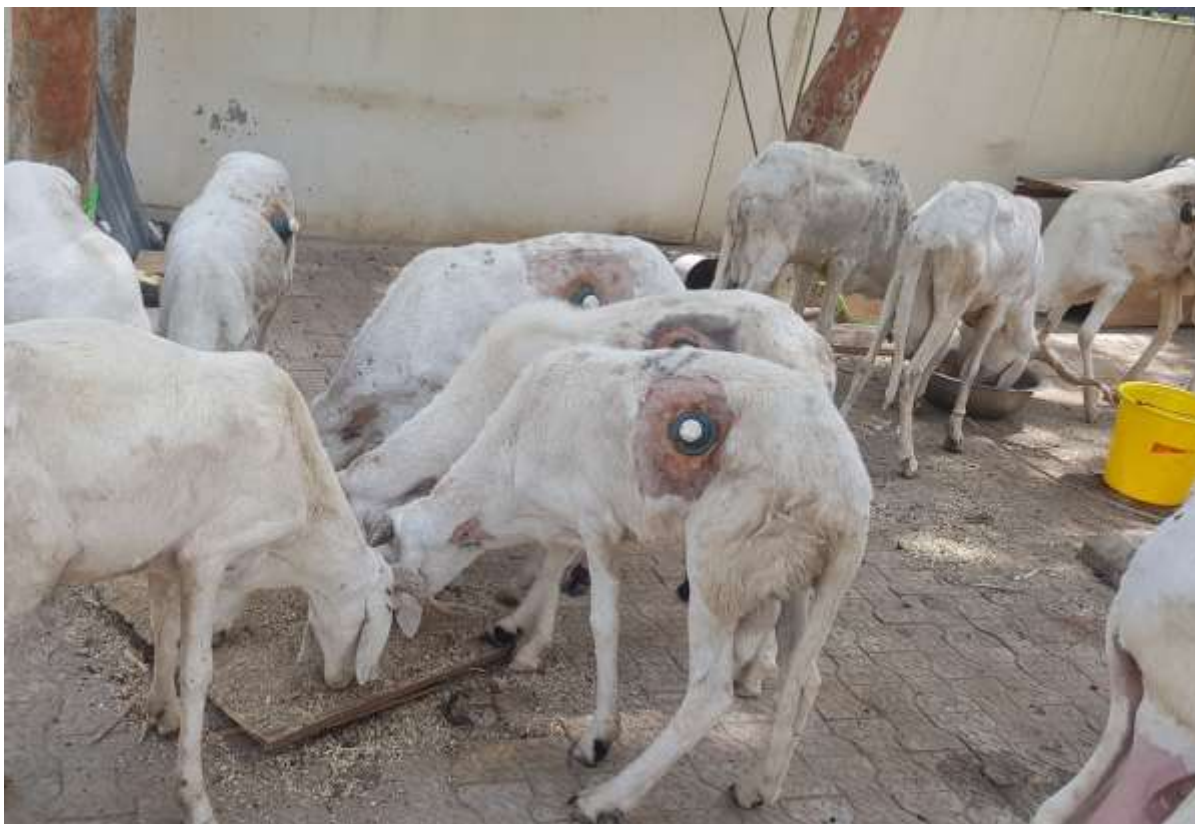
Figure 4: Yankasa-Balami cross bred rams expressing good postsurgical conditions by feeding after undergoing rumenostomy in a stylized skin and rumen incisions.