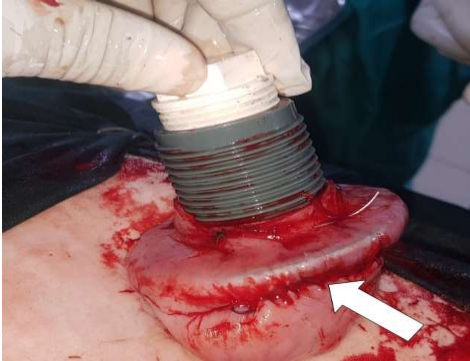
Figure 2: An improvised polyvinyl chloride plastisol (PVC) rumen cannula exited via secondary rumen incision and a purse string suture thrown around the base of the exited PVC cannula and a sutured or closed primary rumen incision (white arrow) through which the cannular was initially inserted.