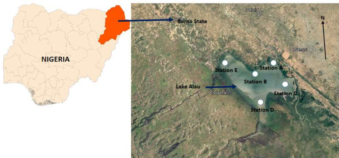
Figure 1: Google map of Lake Alau showing sampling stations

March to May, marking the driest period with intense heat. During this period temperature value of 46-48 0 C has been recorded (Chad Basin Development Authority [CBDA], 1986; Bankole et al. , 1994; Fasesan 2000; Idowu 2004; Abubakar et al. , 2011; Usman et al. , 2014).