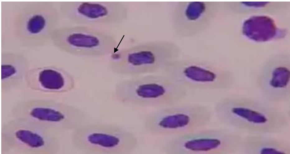
Plate 2: Photomicrograph of a thin blood smear of LSC showing Plasmodium spp (arrow). Giemsa stain x100