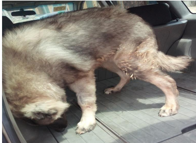
Fig. 1: Dog (Bruno) on presentation

A client presented his 7 months Dog (Bruno) weighing 20kg to Small Animal Clinic of Veterinary Teaching Hospital, University of Maiduguri with the chief complaints of progressive weakness, passing out bloody diarrhea that later became mucoid, with vomiting, and inappetence. History has it that the Dog was vaccinated with one shot of DHLPP vaccine only at five weeks.