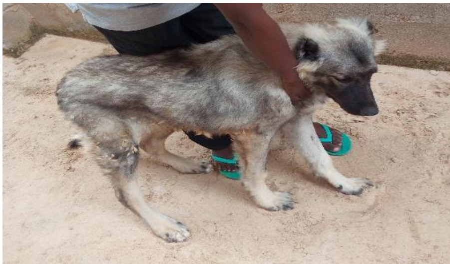
Fig. 4: Bruno during one of the visitation

The dog finished taking all of its prescriptions, recovered, and was released. On visitation, the dog was noted to have recovered from all the presenting clinical indications of the sickness and it is now eating well (Fig. 4).