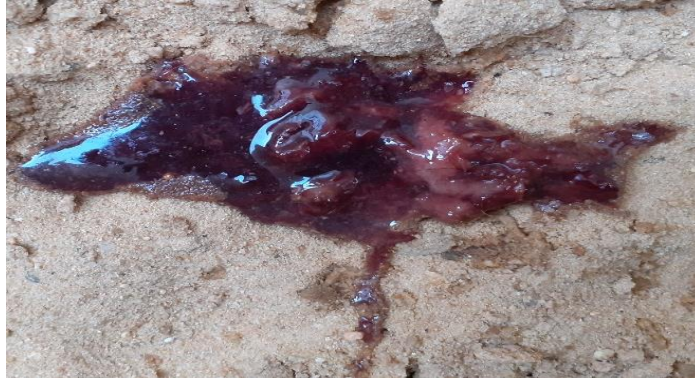
Fig. 2: Foul smelling bloody diarrhea