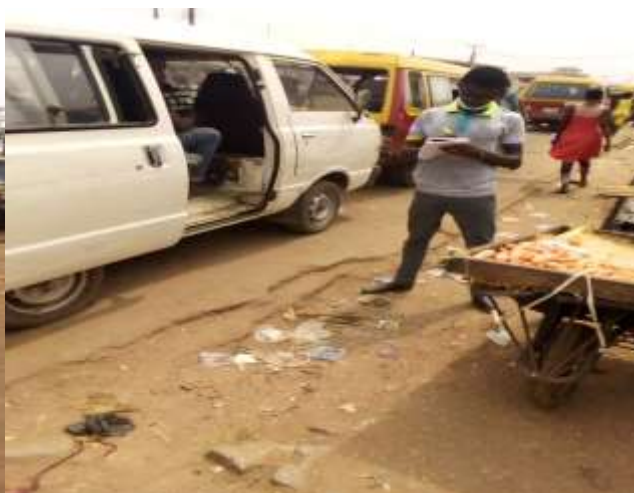
Plate 1B: Pictorial view of the motor park with hawkers