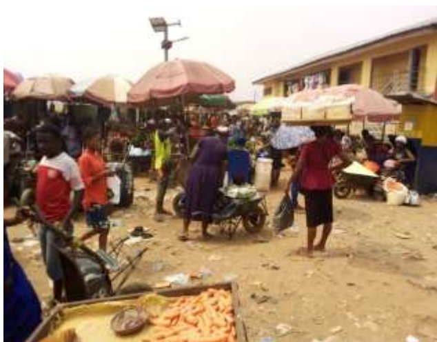
Plate 1C: Pictorial view of the motor park with sellers with edible items sold at Ekiosa markets