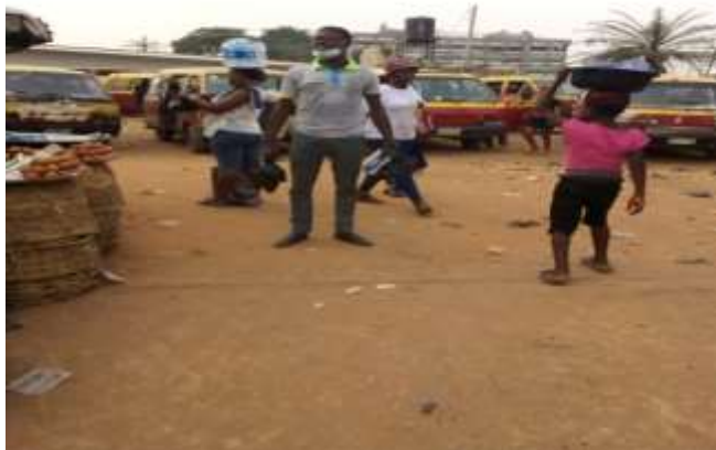
Plate 1A: Pictorial view of the motor park with hawkers