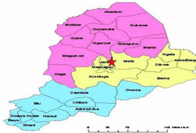
Figure 1: Map of Borno State, Nigeria showing the location of the study area (Maiduguri Abattoir)

maximum of 45°C in March and minimum of 15°C during the dry harmattan season. The annual rainfall ranges from 750-1000mm (NiMET, 2022). Agriculture is the major occupation of the people and about 70% to 80% of the people engage in farming activities which is predominantly subsistence (NiMET, 2022).